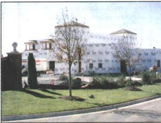
South Suburban Animal Hospital is scheduled to open this winter.